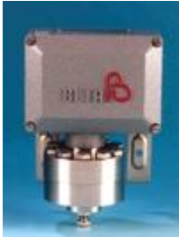
Figure 1: C-Series

The Pressure, Temperature and Vacuum Switches are considered to be Type A subsystems with a hardware fault tolerance of 0.