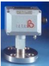
Figure 3: Z-Series

The explosion proof (Eex-d IIC T6) W-series, in cast aluminium, SS316 or V5 series in cast iron enclosures. Pressure ranges starting from 2 mbar to 540 bar. Vacuum ranges / Differential ranges and Temperature ranges available. Several options and specials possible.