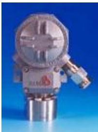
Figure 2: W-Series

The weatherproof C-Series, in cast aluminium or 316SS enclosures. (Optional also Eex ia/b IIC T6). Pressure ranges starting from 2 mbar to 540 bar. Vacuum ranges / Differential ranges and Temperature ranges available. Several options and specials possible.