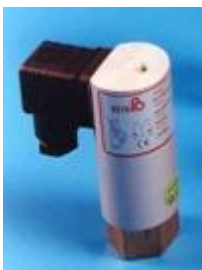
Figure 4: B-Series

The explosion proof (Eex-ed IIC T6) Z-series, in cast aluminium or 316SS enclosures. Pressure ranges starting from 20 mbar to 540 bar. Vacuum- / Differential ranges and Temperature ranges available. Several options and specials possible.