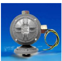
Figure 5: G-Series

The OEM range the BETA MINI switch is anodized aluminium enclosure fixed Hirschmann connector. Pressure ranges starting from 0.3 bar to 540 bar. Fluid power (hydraulic) range up to 540 bar. Vacuum ranges and Temperature ranges available. Limited option and specials possible.