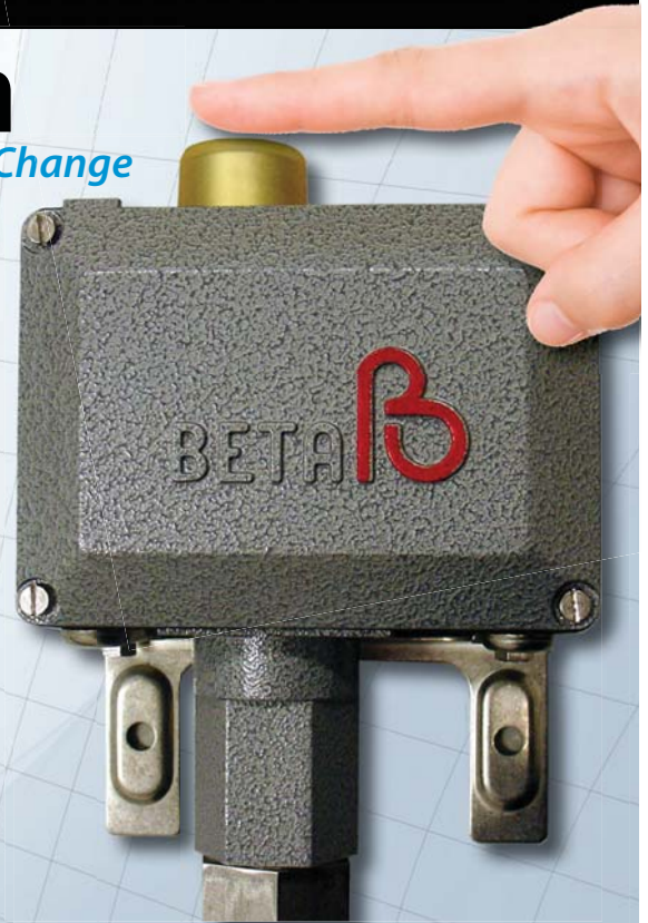
C-Series w/ Manual Reset Option

The SE micro is used on applications that require actuation on increasing pressure, and the SG micro is used on applications that require actuation on decreasing pressure. The manual reset option is included when the SG or SE micro switch is selected and is only available as an SPST relay design.