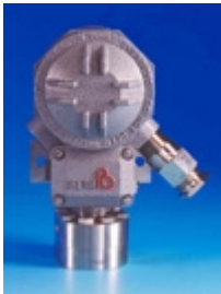
Figure 2: W-Series

The weatherproof C-Series, in cast aluminium or 316SS enclosures. (Optional also Eex ia/b IIC T6). Pressure ranges starting from 2 mbar to 540 bar. Vacuum ranges / Differential ranges and Temperature ranges available. Several options and specials possible.