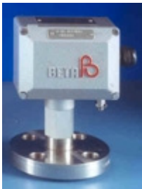
Figure 3: Z-Series

The explosion proof (Eex-d IIC T6) W-series, in cast aluminium, SS316 or V5 series in cast iron enclosures. Pressure ranges starting from 2 mbar to 540 bar. Vacuum ranges / Differential ranges and Temperature ranges available. Several options and specials possible.