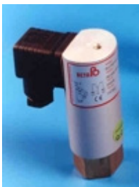
Figure 4: B-Series

The explosion proof (Eex-ed IIC T6) Z-series, in cast aluminium or 316SS enclosures. Pressure ranges starting from 20 mbar to 540 bar. Vacuum- / Differential ranges and Temperature ranges available. Several options and specials possible.