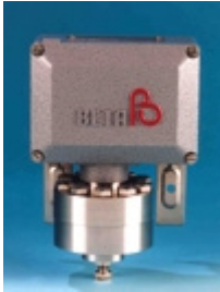
Figure 1: C-Series

The Pressure, Temperature and Vacuum Switches are considered to be Type A subsystems with a hardware fault tolerance of 0.